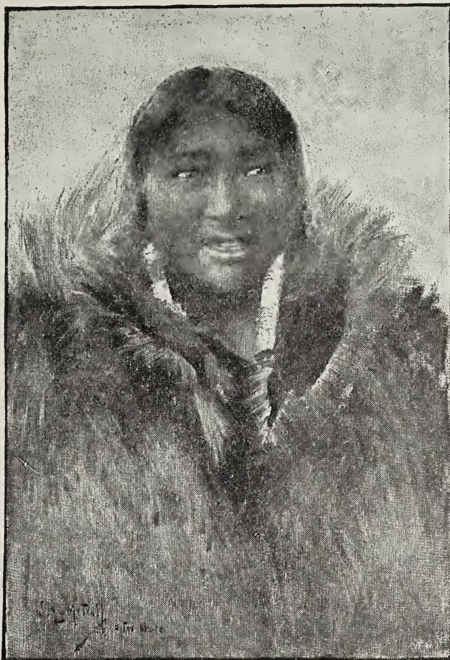
Young Eskimo Woman.